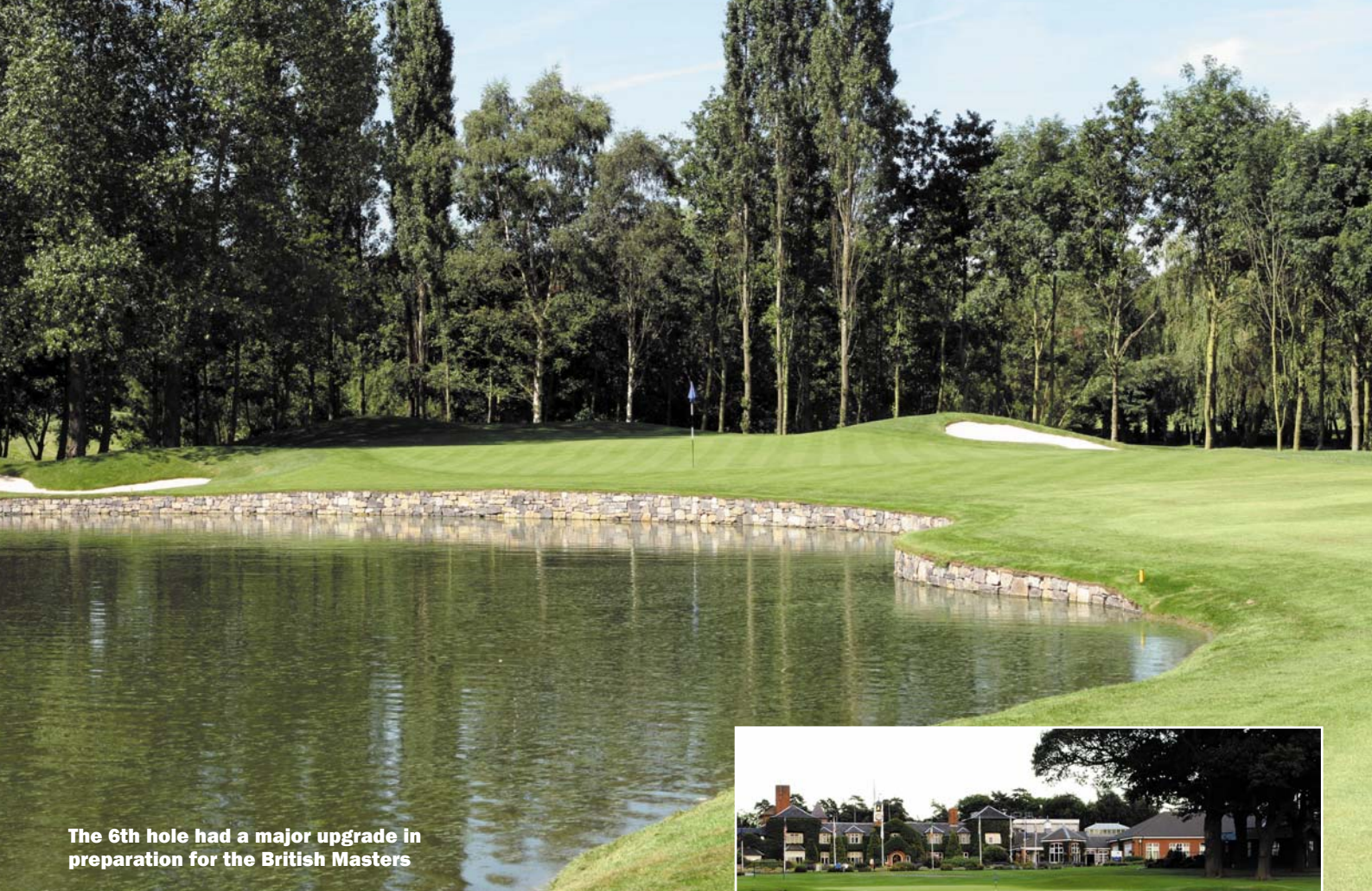
The 6th hole had a major upgrade in preparation for the British Masters

to a depth of 20mm. In addition, the greens are lightly topped once a month.