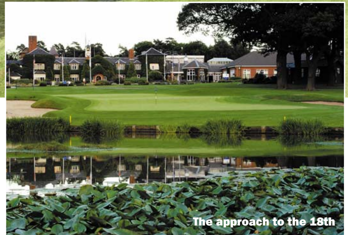
The approach to the 18th

Playing the Brabazon course is an experience no serious golfer should miss. It is a wonderful testament to the superb design skills of its creators thirty years ago and the millions of pounds invested